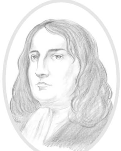
"Those who will not be governed by God will be ruled by tyrants."