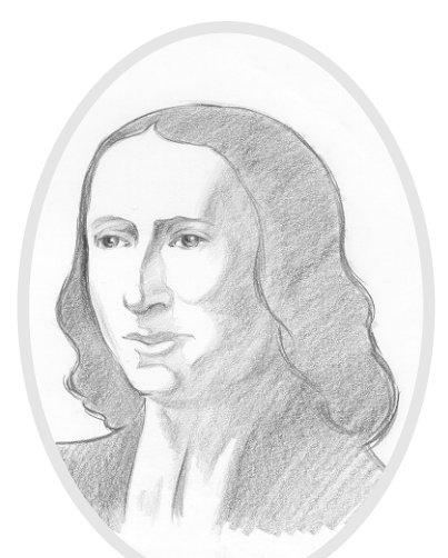
"Before I can preach love, mercy, and grace, I must preach sin, Law, and judgment."